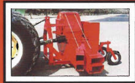
2500 Tractor Mount Blower