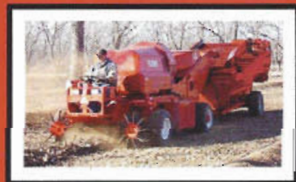
8600 Self Propelled Harvester