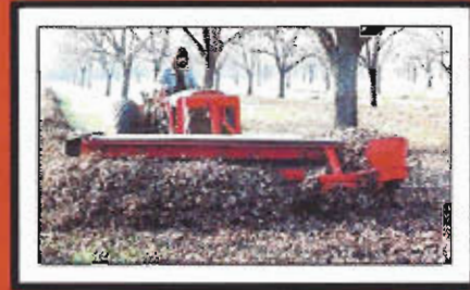
9685/9610 Tractor Mount Sweeper