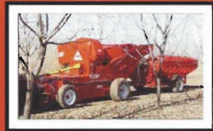
860 - P.T.O. Pecan Harvester